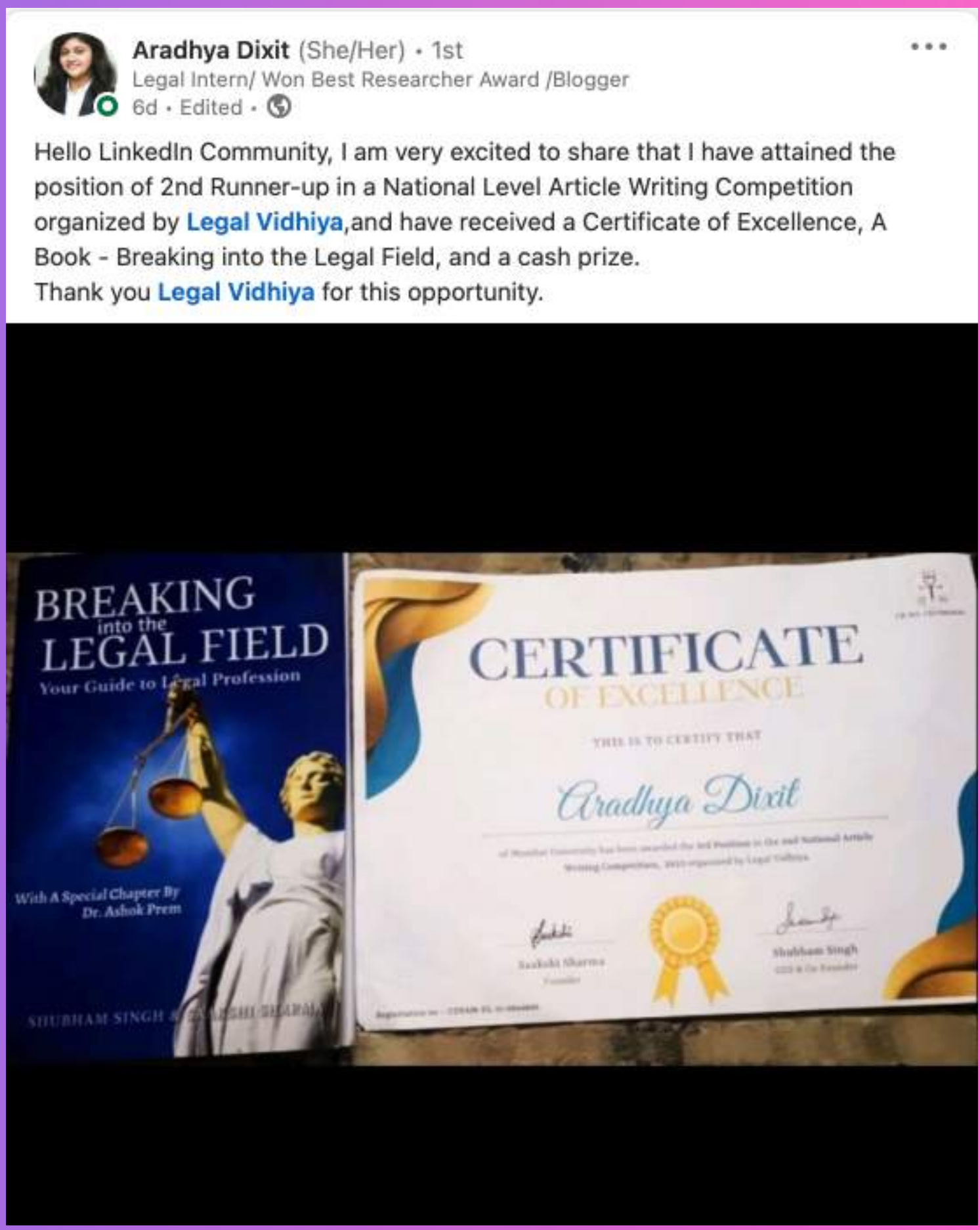
Runner Up of 2nd National Article writing Competition