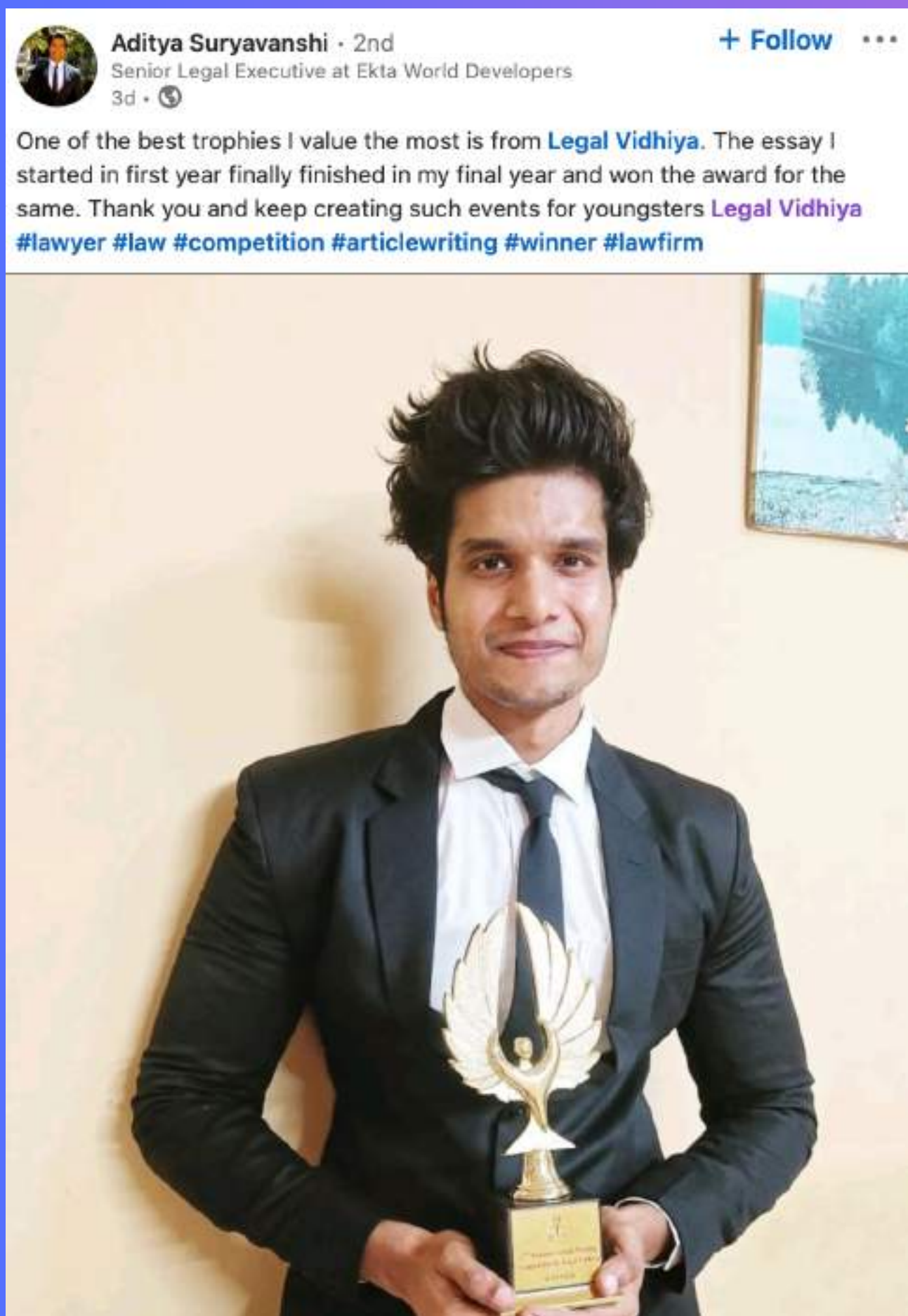
Winner of 2nd National Article writing Competition